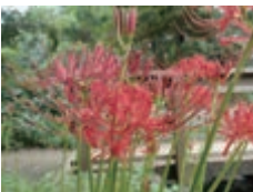
Red spider lily