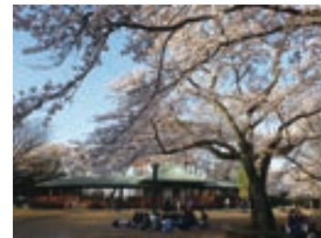
Cherry blossoms at Mt. Masugata